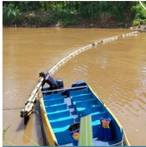
CLEAN UP WITH TRASH BOOM