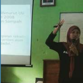
RECYCLE - UPCYCLE WORKSHOP