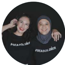
T-SHIRT Seasoldier & Kids T-Shirt