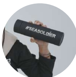
TUMBLER Tumbler Seasoldier