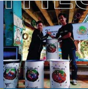
TRASH CAN DONATION