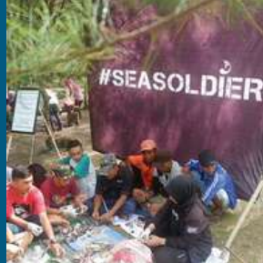
BEACH CLEAN UP (DIVING)