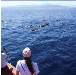
DOLPHIN WATCHING/ SAILING