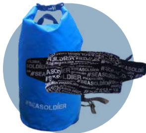
BAG Dry Bag & Waist Bag