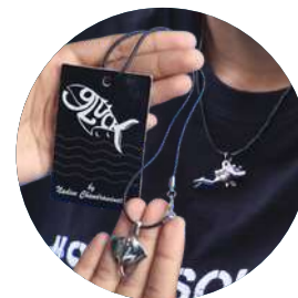
NECKLACE Diver & Manta