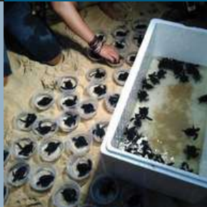
SEA TURTLE RELEASE & CONSERVATION